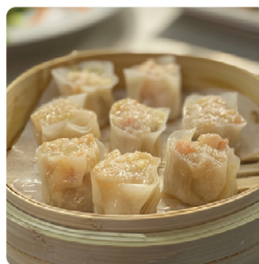
Large Gourmet Shrimp Shumai

Pack Size: 6/50 pc* bags Net Wt: 0.56 oz (16 g) pc Piece Ct: 300 pcs* case GTIN: 10071757080116