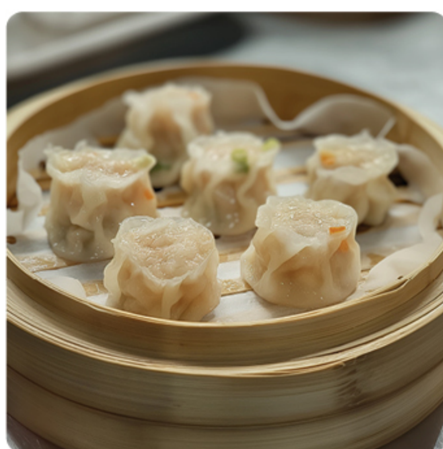
Shrimp Shumai Dumpling

Elevate your customers' dining experience by serving Japan's No. 1 shumai. A must-have appetizer for any Asian menu, AJINOMOTO® shumai are generously filled with fresh shrimp, are sweetly savory, and can be microwaved, steamed, or deep-fried.