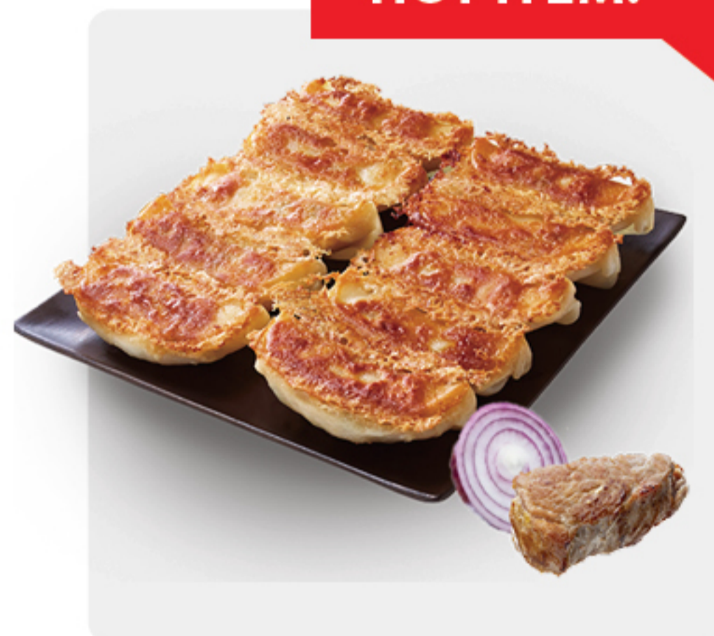
Gourmet Pork Gyoza Dumpling

Pack Size: 20/12 pc trays Net Wt: 0.71 oz (20 g) pc Piece Ct: 240 pcs case GTIN: 10071757080475