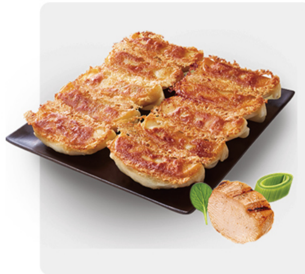
Chicken & Vegetable Gyoza Dumpling

Pack Size: 20/12 pc trays Net Wt: 0.71 oz (20 g) pc Piece Ct: 240 pcs case GTIN: 10071757080123