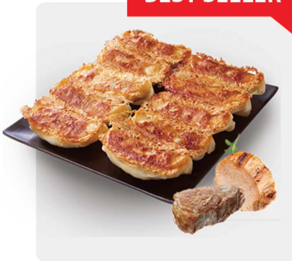
Pork & Chicken Gyoza Dumpling

Pack Size: 20/12 pc trays Net Wt: 0.71 oz (20 g) pc Piece Ct: 240 pcs case GTIN: 10071757080123