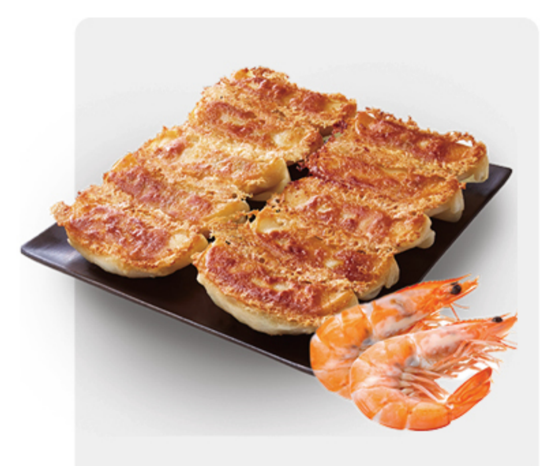
Seafood Gyoza Dumpling

Pack Size: 20/12 pc trays Net Wt: 0.77 oz (21.75 g) pc Piece Ct: 240 pcs case GTIN: 10071757080239