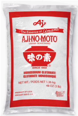
AJI-NO-MOTO® MSG 3 lb Bag

AJINOMOTO® invented AJI-NO-MOTO® MSG over 100 years ago, and we were the first MSG on the market. For more than a century, AJI-NO-MOTO® MSG has been a seasoning and flavor enhancer used to add delicious and savory flavor to any dish, whether you are an everyday cook or a master chef.