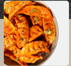
Korean Fried Chicken Kimchi Potstickers