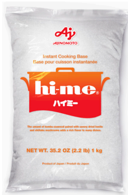
hi-me® Instant Cooking Base 2.2 lb Bag

hi-me® is a seasoning and flavor enhancer with a well-balanced blend of the umami ingredients found in seaweed, bonito fish, and shitake mushrooms. Its umami flavor is 13x stronger than MSG! You can make up to 2,500 bowls of broth with 1 bag of hi-me®.