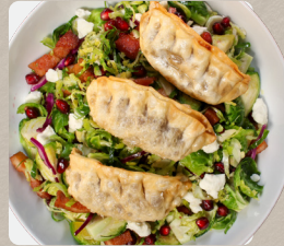
Apple Pie Potsticker with Brussels Sprout Salad