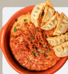
Southwestern Queso Fundido Potstickers