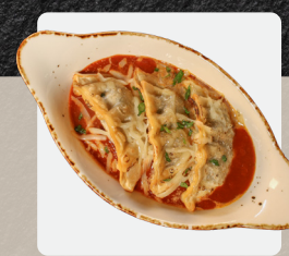
Mole Southwest Chicken Potstickers