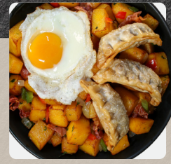
Apple Pie Potstickers over Autumn Hash