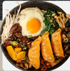
Kimchi Potsticker Bibimbop