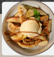
Vanilla Ice Cream Apple Crisp