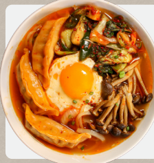
Kimchi Potsticker and Tofu Soup